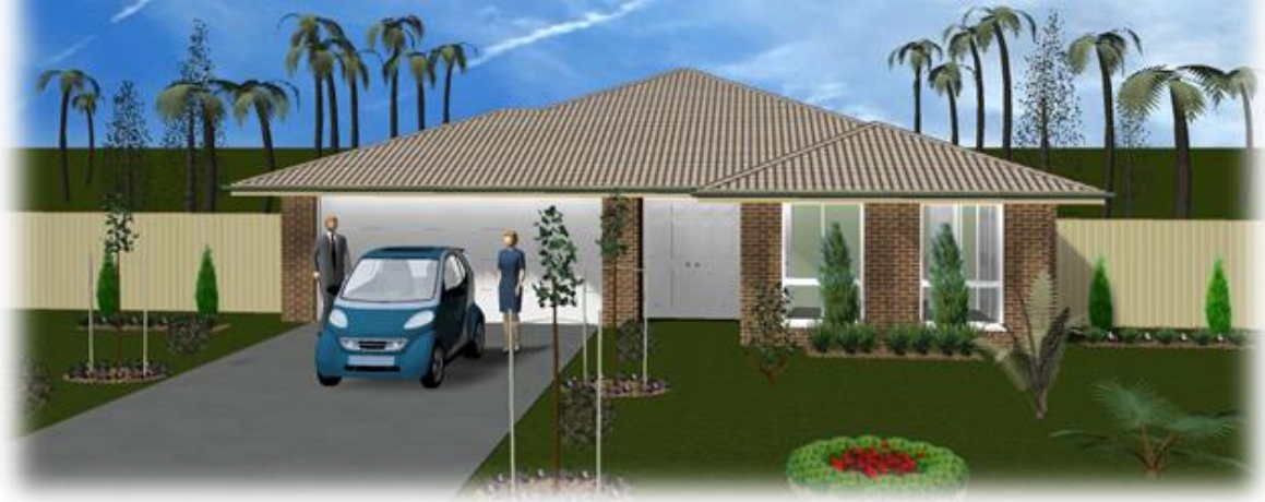
Artist Impression Front