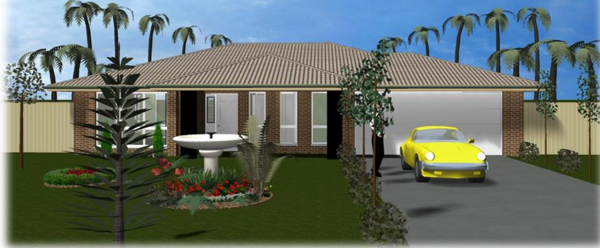
Artist Impression Front