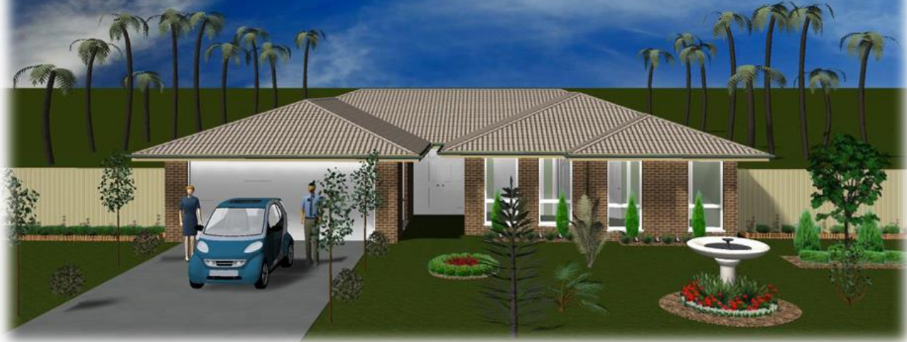
Artist Impression Front