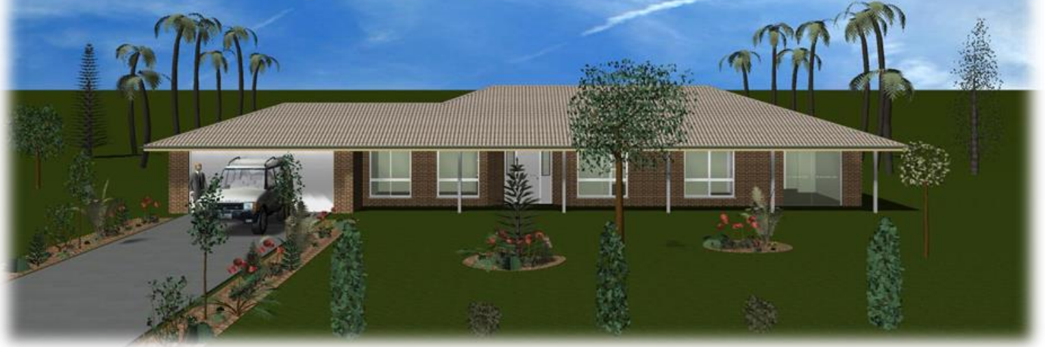
Artist Impression Front