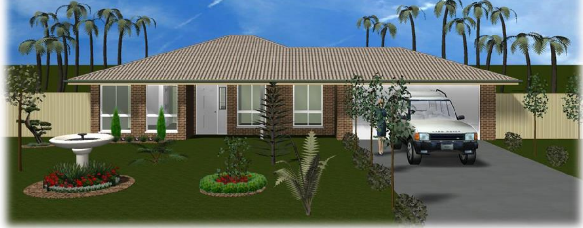
Artist Impression Front