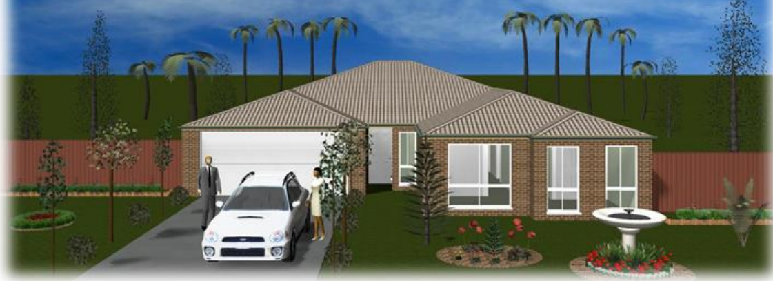
Artist Impression Front