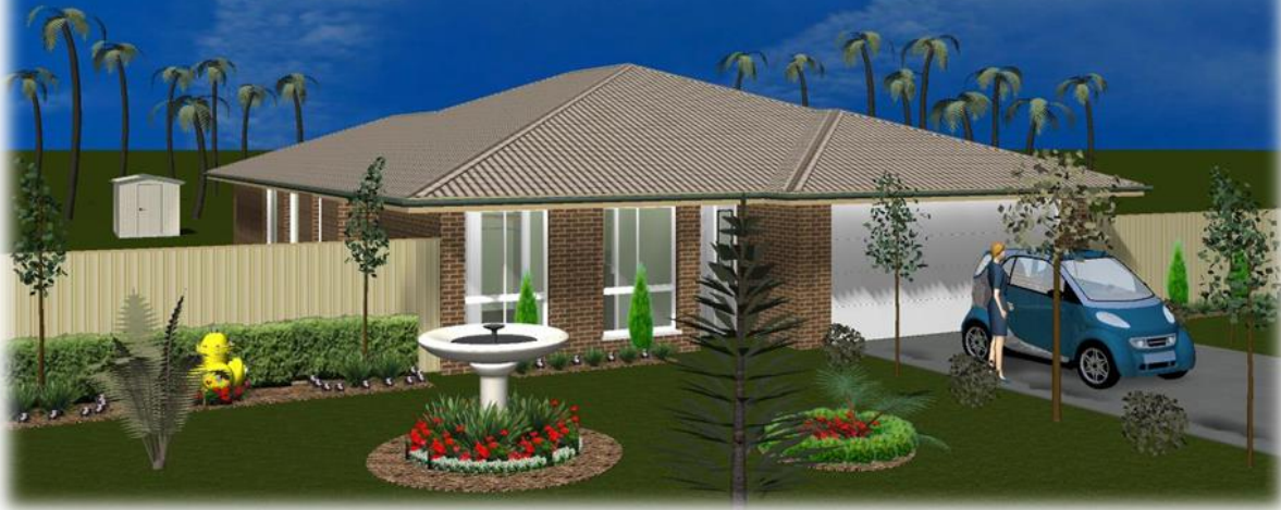
Artist Impression Front