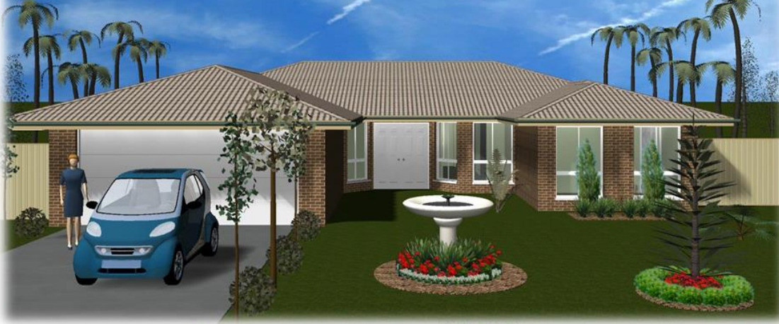
Artist Impression Front