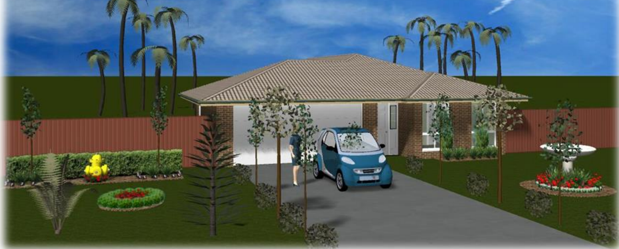
Artist Impression Front