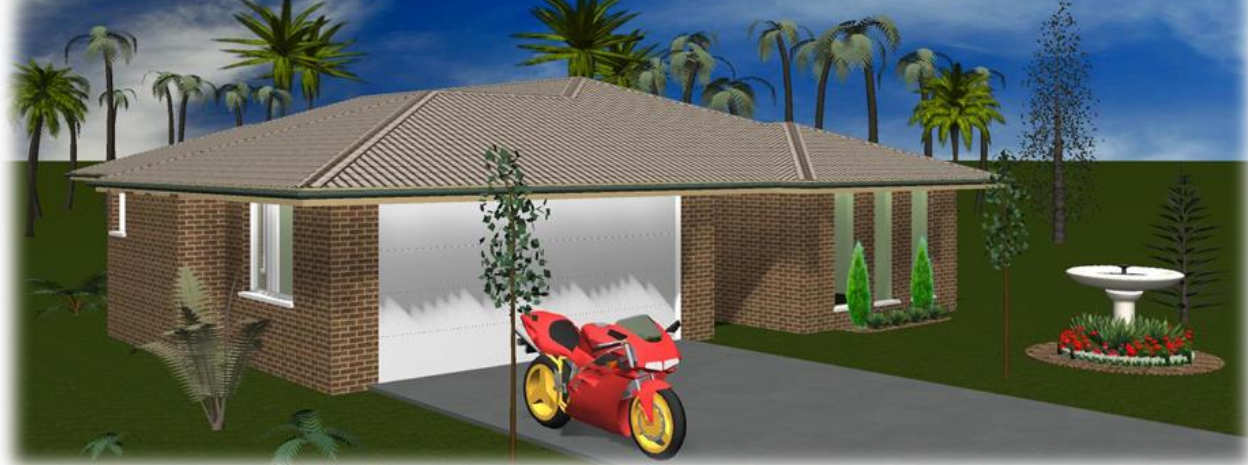
Artist Impression Front