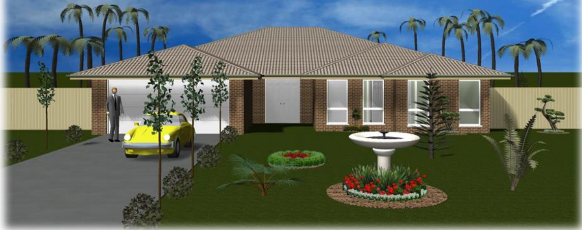
Artist Impression Front