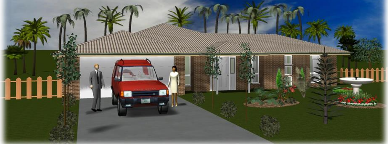
Artist Impression Front