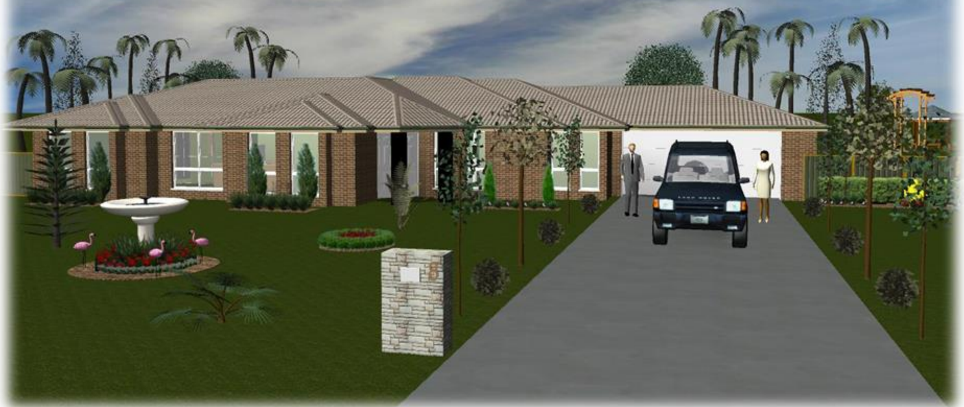
Artist Impression Front