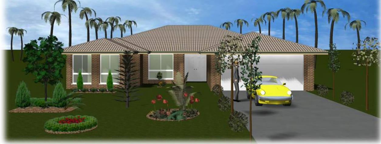
Artist Impression Front