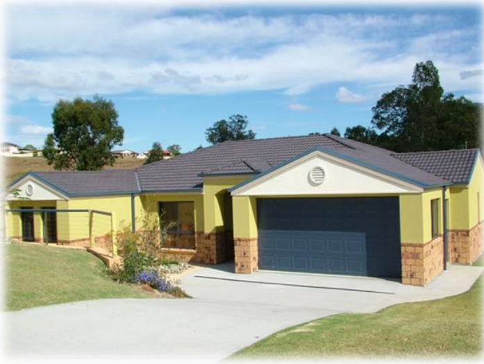
Photographic Impression Front