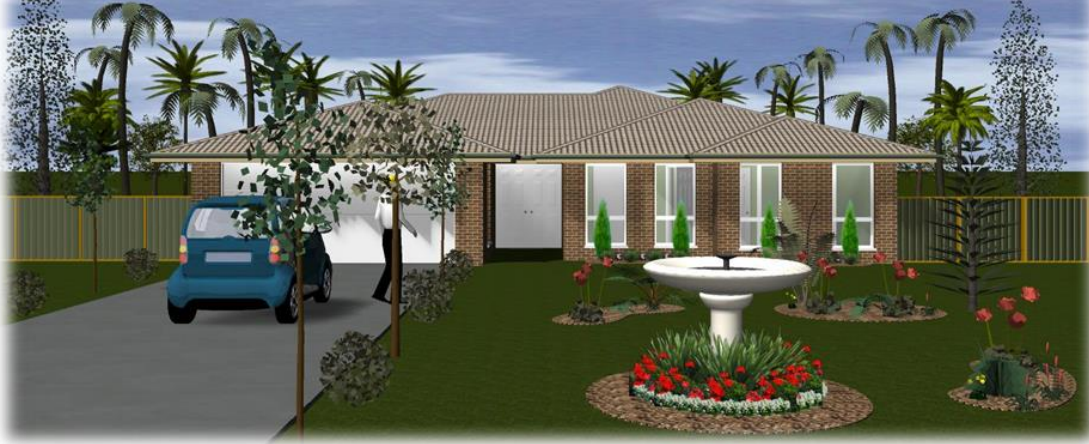
Artist Impression Front