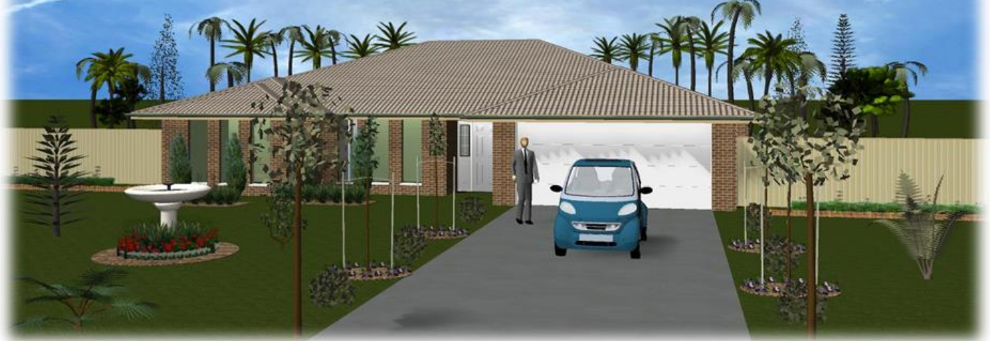
Artist Impression Front