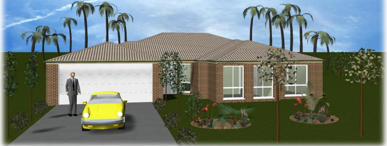
Artist Impression Front