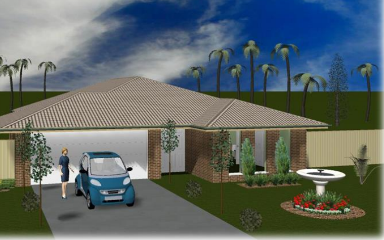
Artist Impression Front