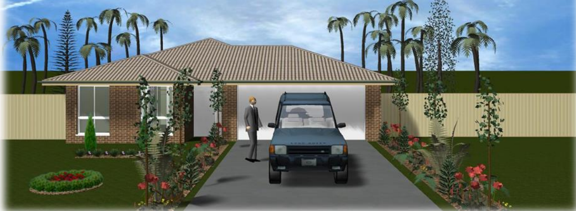
Artist Impression Front