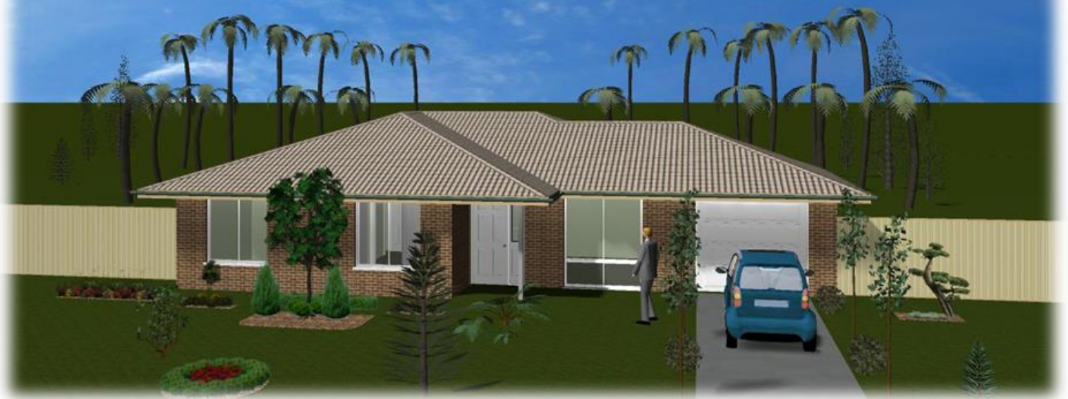
Artist Impression Front